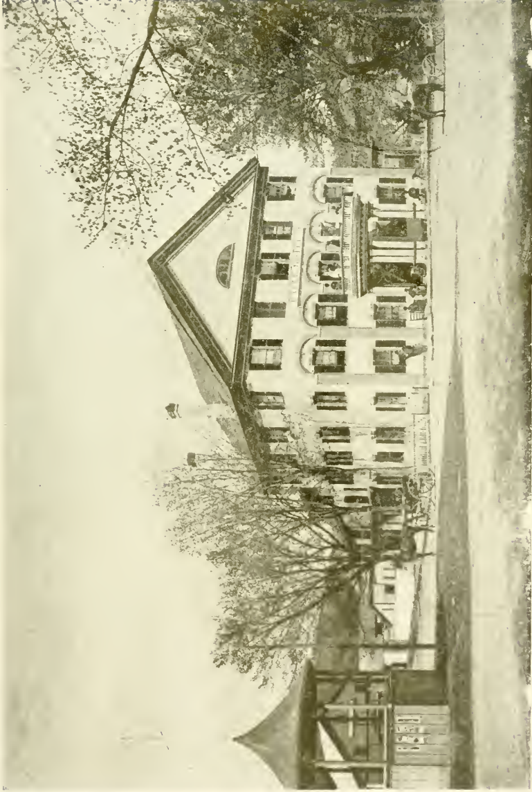
A FAMOUS OLD-TIME LANDMARK OF CHARLESTOWN . . . . The Eagle Hotel